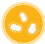
AIR QUALITYTESTING: MOLD