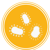
AIR QUALITY TESTING: MOLD